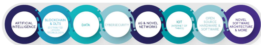
FIGURE 2. NGI SARGASSO TECHNOLOGY DOMAINS

Proposals submitted to the NGI Sargasso Open Call 4 could use some of the following base technologies to address the challenges in the above areas of knowledge: Artificial Intelligence, Blockchain and DLTs (Distributed Ledger Technology), Data, Cybersecurity, 6G and novel networks, IoT (Internet of Things), Open-source hardware and software, novel software architectures, etc.